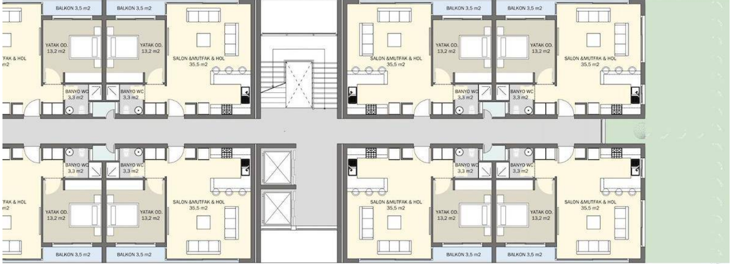
B BLOK TIP KAT PLANI