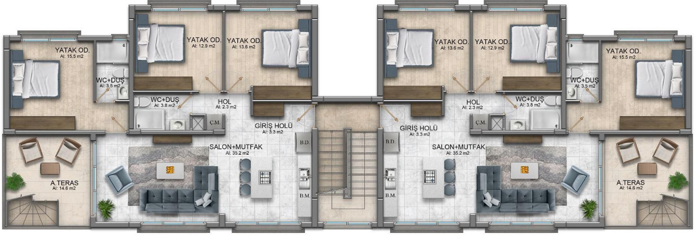
1. KAT PLANI C TİPİ