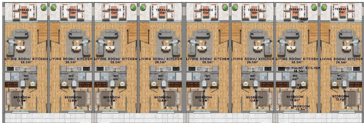
2+1 LOFT TYPE PENTHOUSE FLOOR PLAN