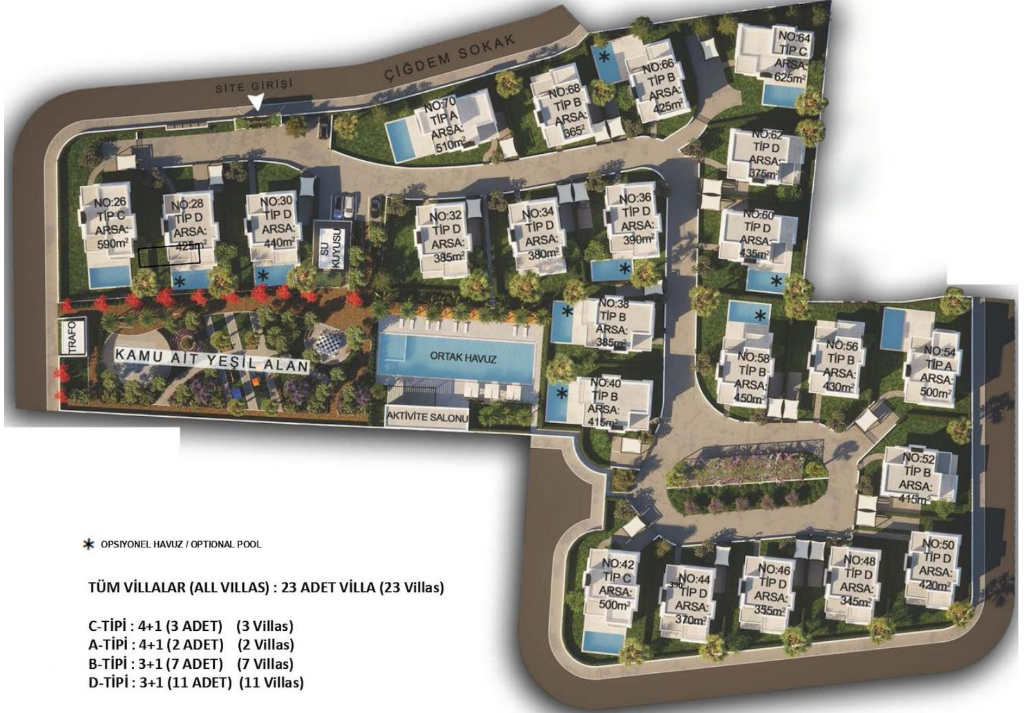
VAZİYET PLANI – LAYOUT PLAN