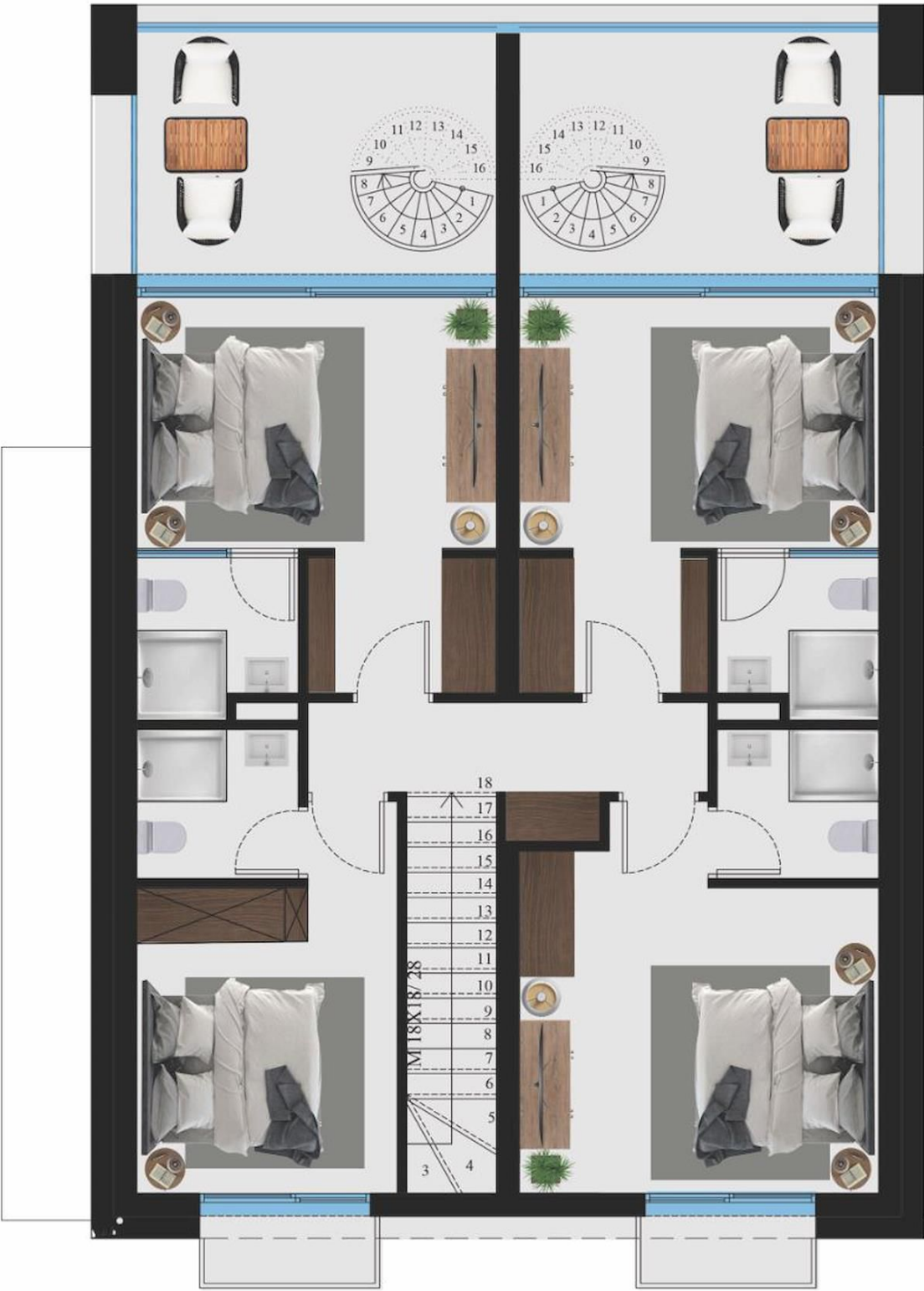
4+1 1.KAT PLANI