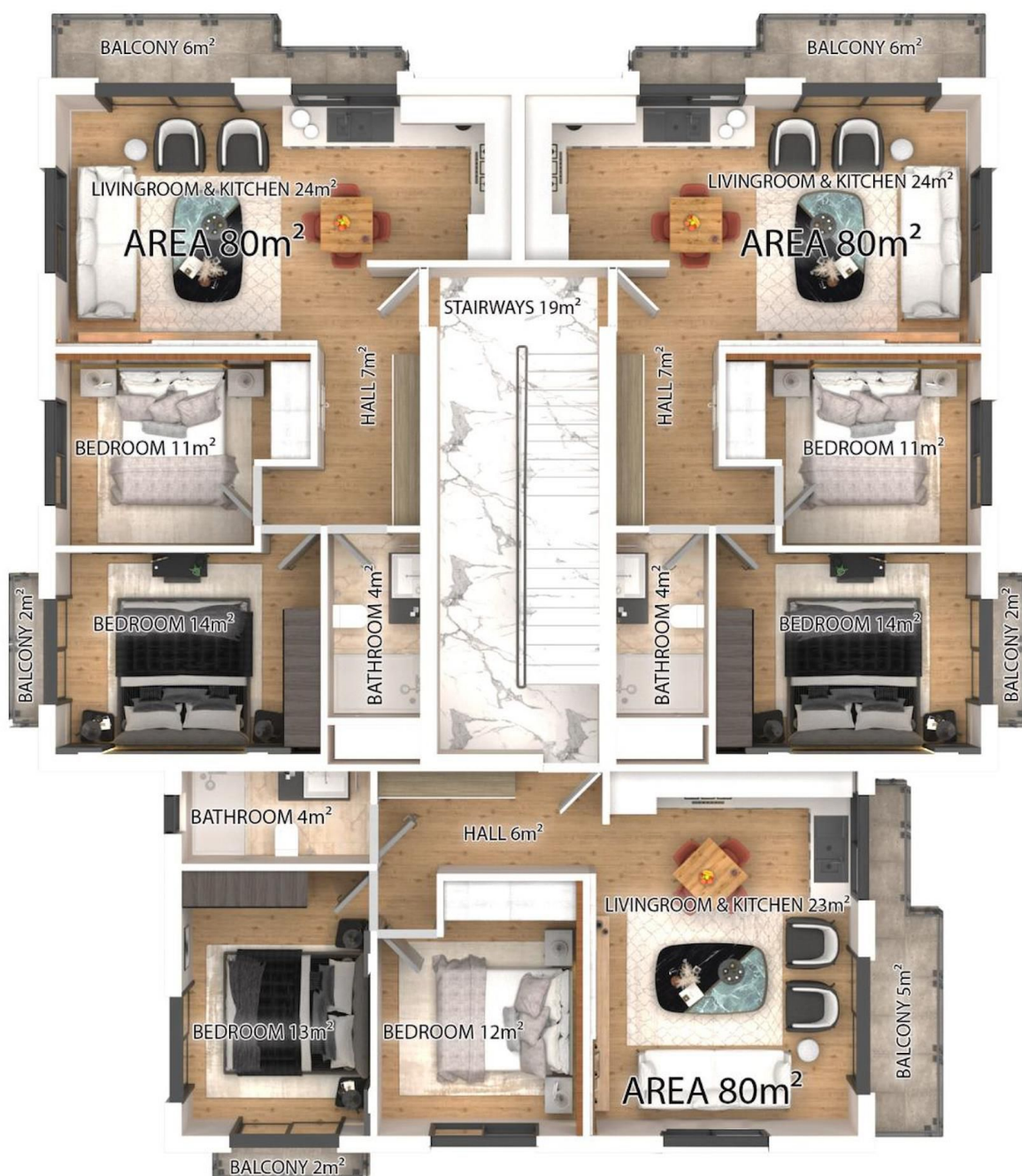
A BLOCK 1st & 2nd FLOOR PLAN