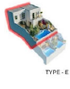
TYPE - E