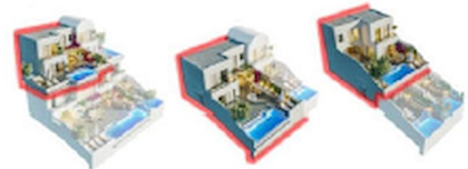
TYPE - A