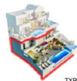
TYPE - A