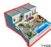
TYPE - C