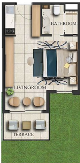
GARDEN FLOOR x 67

TOTAL 280 APARTMENT 134 (1+0) 140 (1+1) 4 (2+1) 2 (3+1)