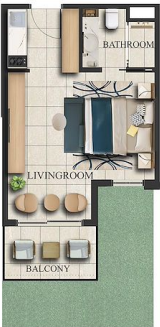
FIRST FLOOR x 67