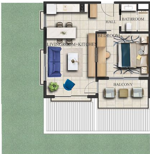
FIRST FLOOR x 70