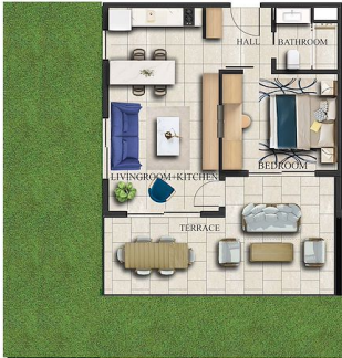
GARDEN FLOOR x 70