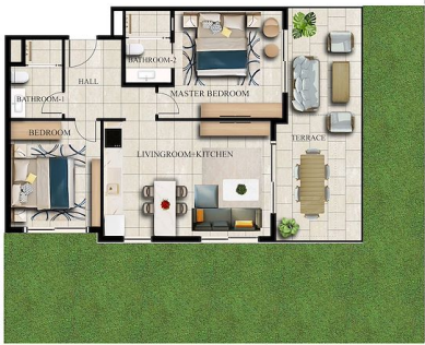
GARDEN FLOOR x 2