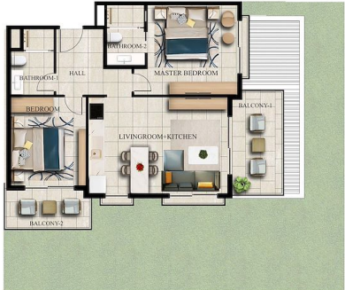
FIRST FLOOR x 2