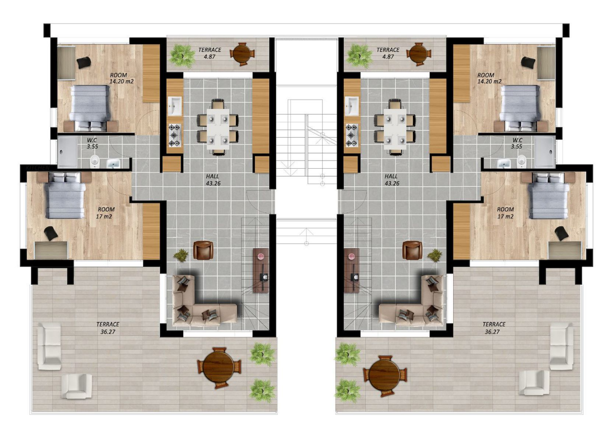
TYPE C FIRST FLOOR PLAN