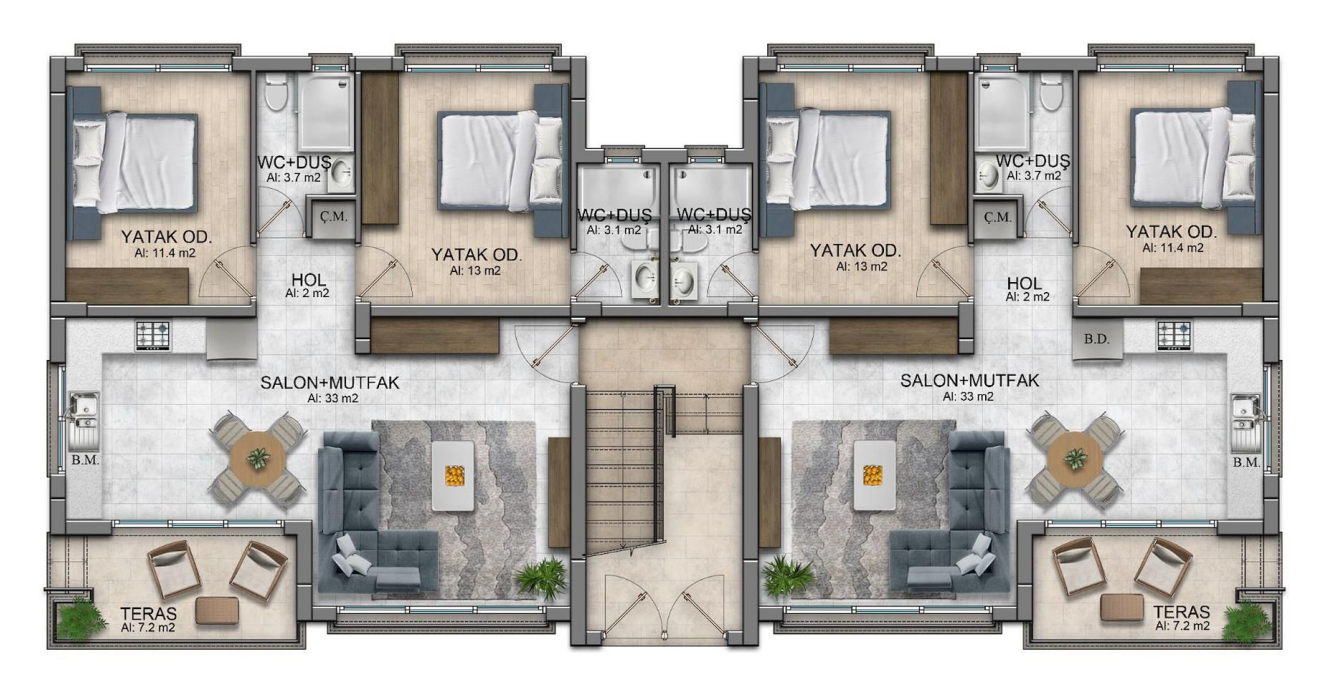
ZEMİN KAT PLANI A TİPİ