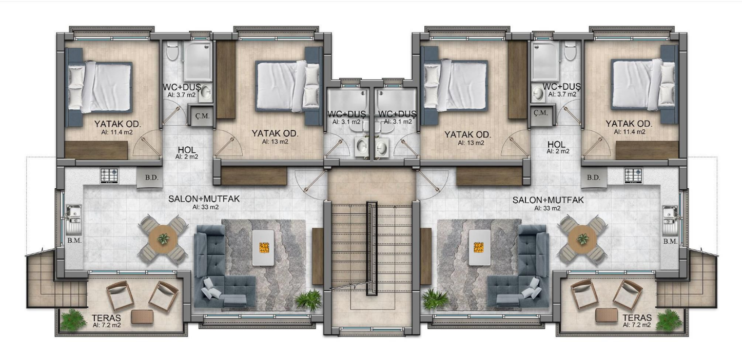
1. KAT PLANI A TİPİ