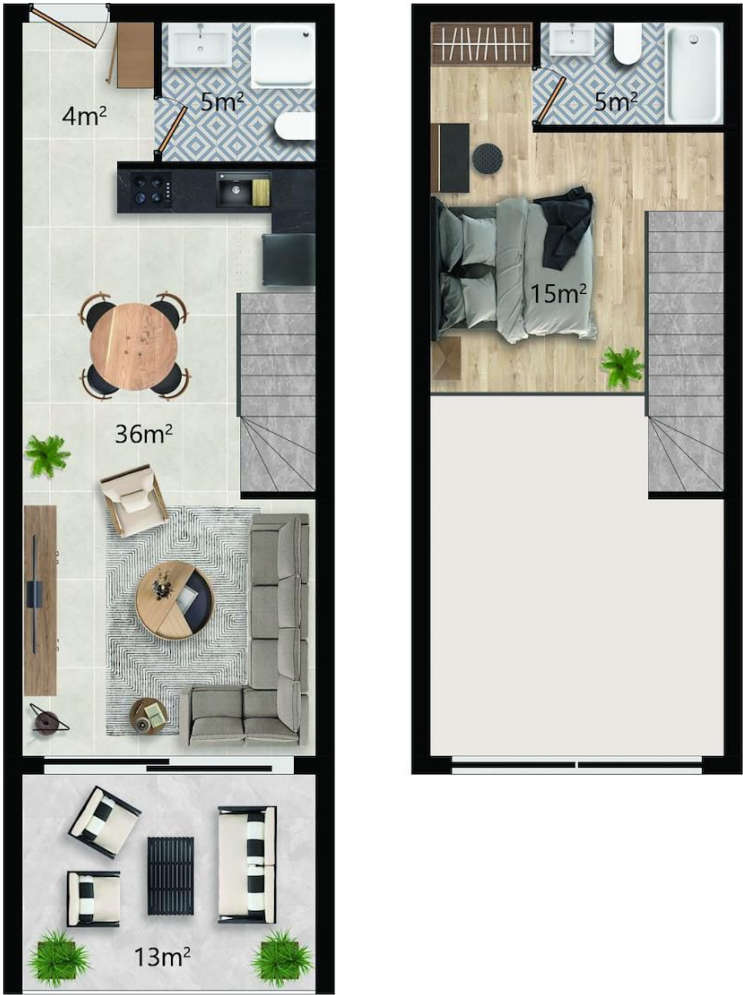
1+1 DUPLEX FLOOR PLAN