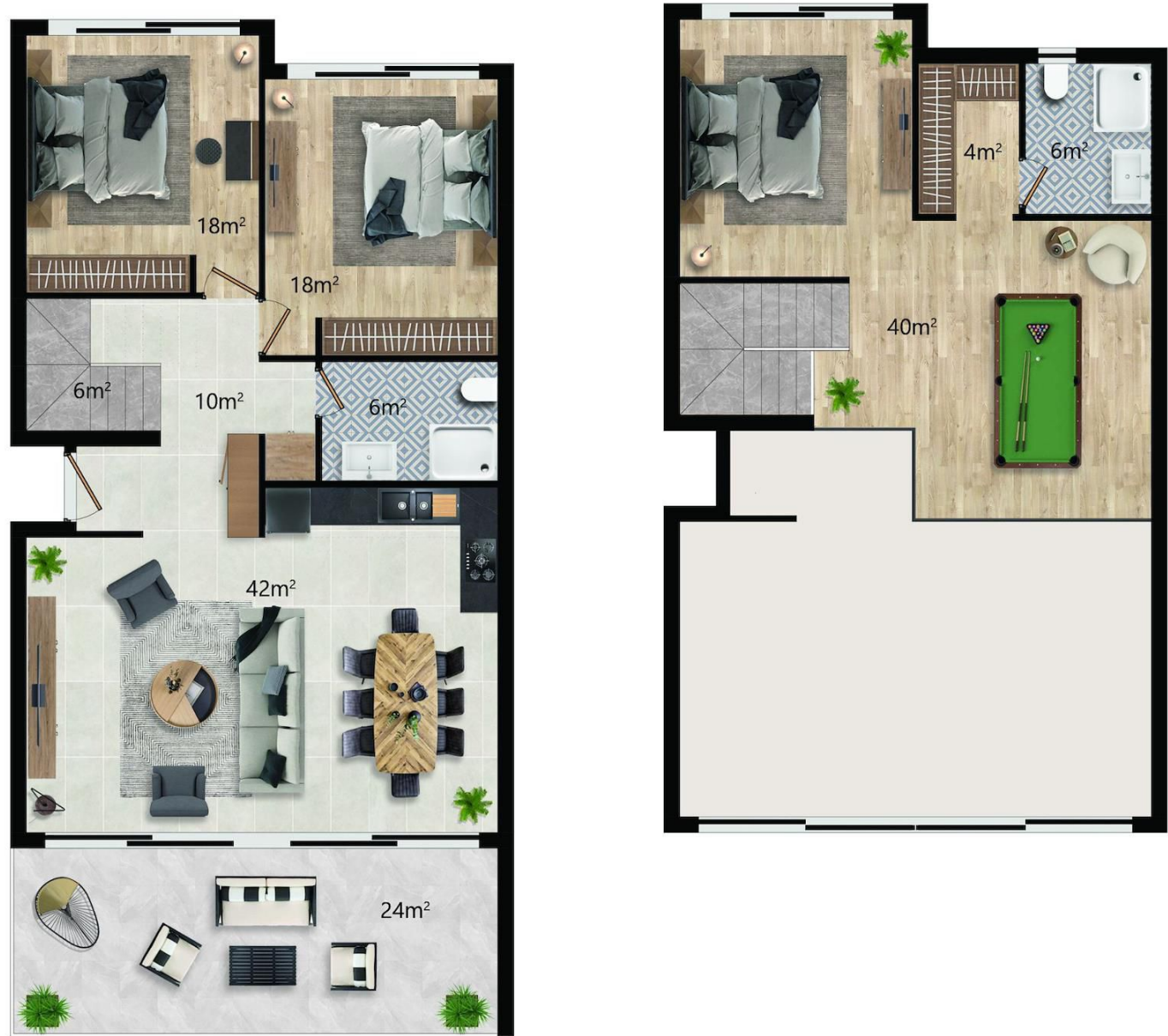
3+1 DUPLEX TYPE A - FLOOR PLAN