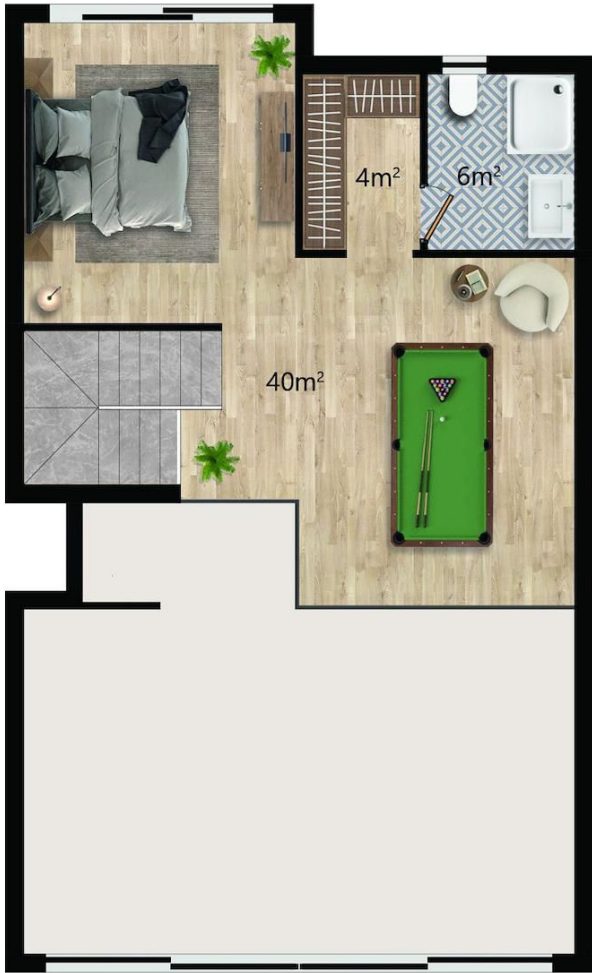
3+1 DUPLEX TYPE A - FLOOR PLAN ELYSIUM 2